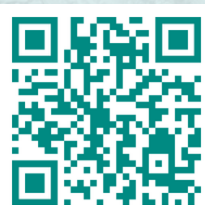
Figure it Out With Coaching

If you'd like step-by-step guidance through this process and actually discover all nine of the most important things to discover about a job of interest, consider taking the Know Before You Go digital course. Click HERE to learn more or scan the code.