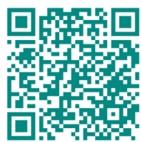
Figure it Out With a Course

If you'd like step-by-step guidance through this process and actually discover all nine of the most important things to discover about a job of interest, consider taking the Know Before You Go digital course. Click HERE to learn more or scan the code.